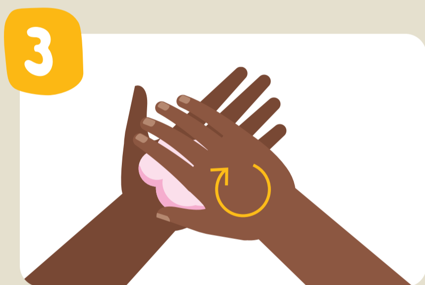
Lather & scrub